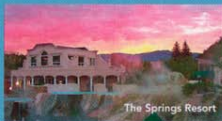
The Springs Resort

Pagosa Baking Company: 970-264-9348. Wolf Creek Ski Area: 970-264-5639; $47 lift ticket. The Springs Resort: 970-264-4168; hotel guests soak for free.