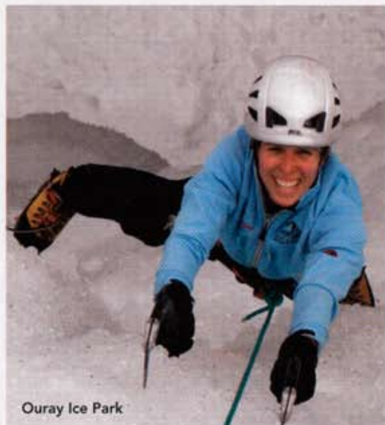
Ouray Ice Park

Ridgway State Park: 970-626-5822. Orvis Hot Springs: 970-626-5324; hotel guests soak for free. The Adobe Inn: 970-626-5939.