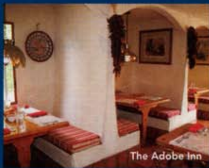
The Adobe Inn