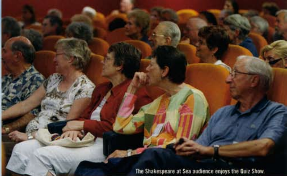
The Shakespeare at Sea audience enjoys the Quiz Show.

There are different strokes for different folks — and a theme cruise is a great way to make like-minded friends.