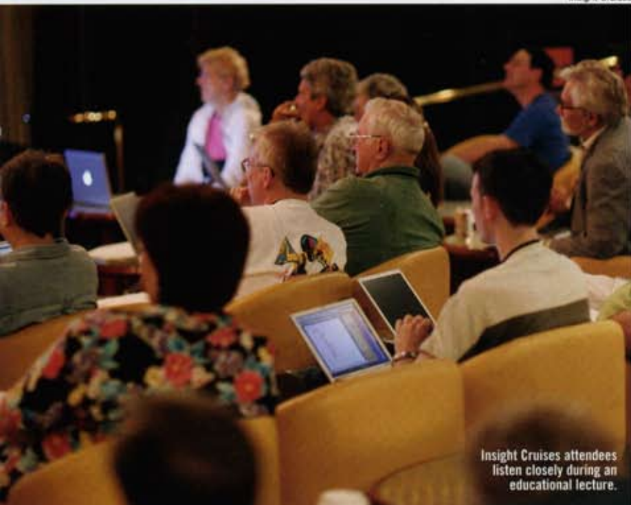
Insight Cruises attendees listen closely during an educational lecture.

a computer programming language. He figured other “geeks” like him would enjoy a shipboard conference centered on Perl.